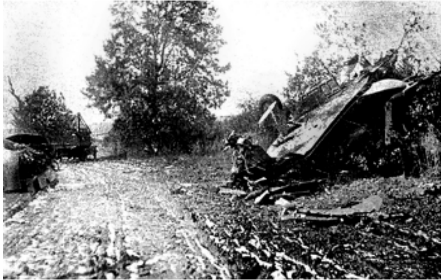
After three months of war, the majority of the Soviet combat aircraft that had been on hand in the western parts of the USSR on June 22, 1941 had either been shot down, destroyed on the ground, or deserted during the retreat. This photo shows the remains of downed Su-2.

A total of 1,603 German aircraft had been destroyed, and a further 1,028 had been damaged on the Eastern Front between June 22 and September 27. Indeed, the Luftwaffe's losses during the three first months of Operation Barbarossa were higher than during the Battle of Britain, where it sustained 1,385 combat losses from July to October 1940. 15 Recently, a number of Luftwaffe units had been pulled out of action due to the severe losses. Among them were the two Zerstörergruppen of ZG 26 and the Bf 110-equipped SKG 210. These units had achieved impressive results: ZG 26 claimed to have destroyed about 1,000 Soviet aircraft in the air and on the ground, plus 300 vehicles and 250 tanks; and SKG 210 was credited with the destruction of 519 Soviet aircraft, 1,700 vehicles, and 83 tanks. But their own losses rendered these Gruppen unbattleworthy after three months of combat. The loss of the Bf 110 units would be detrimental to the close-support missions of the Luftwaffe.