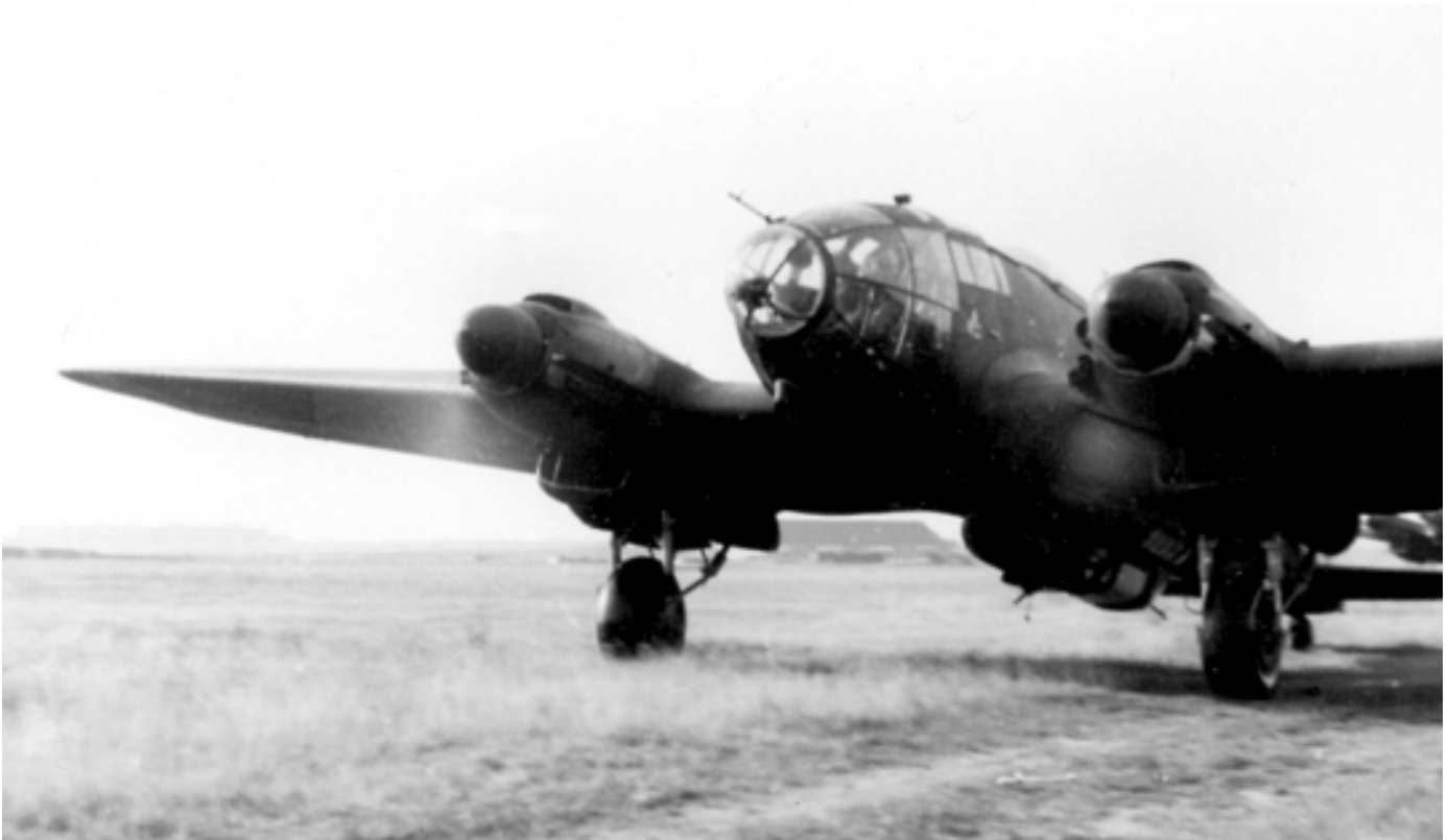
At the onset of Operation Typhoon, clear skies dominated, thus enabling Luftflotte 2 to launch all its forces in a maximum effort against the elements of the Soviet Western, Reserve, and Bryansk fronts. During the first five days of October 1941, Luftflotte 2 carried out more than 4,000 sorties in support of Army Group Center.

The efficiency of these nocturnal intruding U-2s—nicknamed "sewing machines" due to their characteristic engine sound—was proven not only by the diversion of Luftwaffe fighters to night operations but also by the fact that the Germans later plagiarized this tactic on the Eastern Front, forming the Nachtschlachtgruppen,