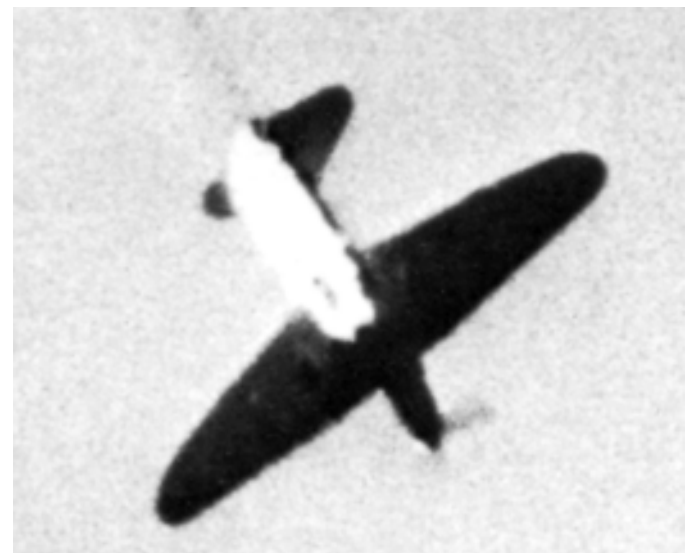
One of several thousand Soviet aircraft shot down in 1941. This Il-2 Shturmovik, which fell prey to Hauptmann Gordon Gollob of II./JG 3, descends toward earth with its oil tank fully ablaze. It is obvious that the pilot of this aircraft was not experienced enough to protect the vulnerable belly of the Il-2 by flying at extremely low altitude. Caught from below, the Il-2 was easy prey to Luftwaffe fighter pilots.

Just as during the two previous deadly threats against Russia in history—from the Swedes in the eighteenth century and the French in the nineteenth century—the invader reached the pinnacle peak of his success exactly at a point when a shift in weather caused a major deterioration to his situation. During the night of October 6–7, the first snow fell in the Moscow area. Early on