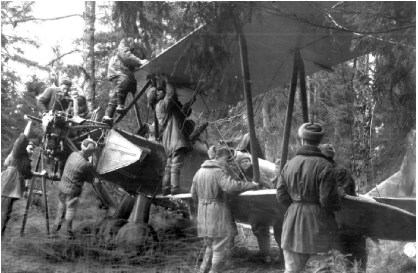
Well hidden under the trees of a Russian forest, a U-2 light bomber undergoes maintenance. The Soviet decision to deploy U-2 trainers and R-5- and R-Z biplanes in the role of harassment bombers over German rear areas at night proved to be quite successful. The Polikarpov U-2 (later redesignated Po-2) was nicknamed "Sewing machine" by the Germans due to its characteristic engine sound. The U-2 was one of the most-produced aircraft in the world. In all, 32,711 U-2s/Po-2s were delivered by the Soviet aircraft industry between 1929 and 1949. Additional numbers were manufactured on license by Poland under the designation CSS-13. More than half of the 19,993 U-2s/Po-2s produced during World War II were delivered from State Aircraft Production Plant No. 169 in Kazan.

Mounds of earth and mud were severe obstructions to the operations of our aircraft. . . .